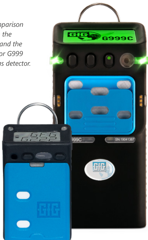
Size comparison between the Micro 5 and the Polytektor G999 multi-gas detector.

« Certified for use in underground operations. »