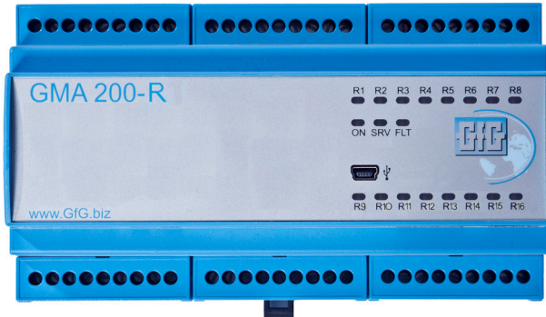
GMA 200-RT *