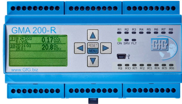
GMA 200-RTD **