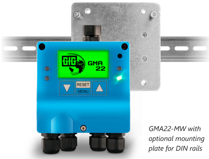
GMA22-MW with optional mounting plate for DIN rails

Even more flexibility is available with the option to address not only the transmitters but also up to 4 additional relay modules from the GMA200-RT or GMA200-RTD through the digital RS-485 interface.