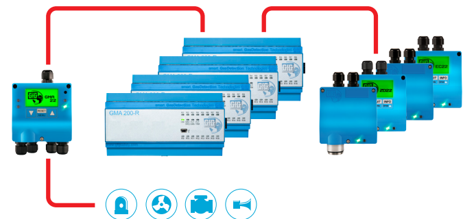
GMA22-MW maximum configuration

ACDC (Analog Carrier for Digital Communication) is a patented technology from GfG. It allows an analog transmitter to communicate with a controller using a 4-20 mA line in the same way that a digital transmitter uses a bus connection to communicate. For example, this allows for remote calibration of an analog transmitter. However, it requires that both devices are ACDC-capable.