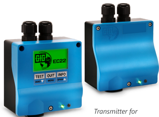
Transmitter for electrochemical sensors, EC22

Feel free to contact GfG anytime if you have question on how to protect your facility or plant in the best way from the hazards of hydrogen.