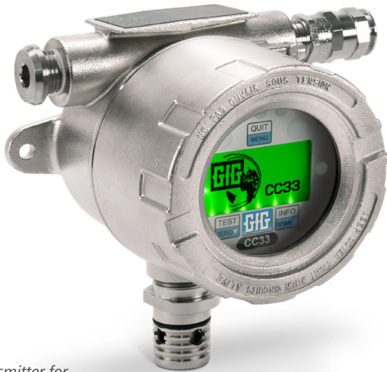
Transmitter for catalytic LEL sensors, CC33

Catalytic LEL sensors detect gas by oxidizing or “burning” the gas. They require the presence of oxygen in order to detect gas. Standard catalytic LEL sensors cannot detect gas if the atmosphere contains too little oxygen. Most of the time measurements for combustible gas are given in percent LEL (% LEL). The reading provides a comparison of the measured concentration against the LEL concentration of the gas used to calibrate the sensor. Catalytic LEL sensors have a higher response to hydrogen than to propane, pentane, and most other gases. When you calibrate the sensor to hydrogen you need to make sure that the alarms are set appropriately for other gases that might be present. The converse is true as well. Deciding which combustible gas or “scale” to use when you calibrate the sensor is an important issue.