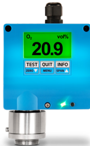
Analog version of the EC22 O with one cable entry and display

However, timely detection of oxygen deficiency is made more difficult when a very light gas such as helium escapes, since its gas density is only 0.14 (air = 1). The EC22 O with partial pressure sensor and display was developed specifically for monitoring oxygen in environments with gases of low molecular weight.